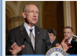
Reid Celebrates Opening of Clark County Shooting Park