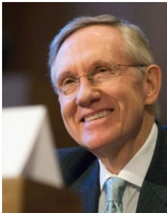
Senator Harry Reid

Reid is hopelessly intertwined in his state's mining culture. He is the son of a miner and owns 14 abandoned mines himself. His two brothers are lawyers representing mining companies, and his son-in-law lobbies for the mining industry. And miners shovel money into his campaign war chest--almost $300,000 so far--and that figure is sure to grow in this